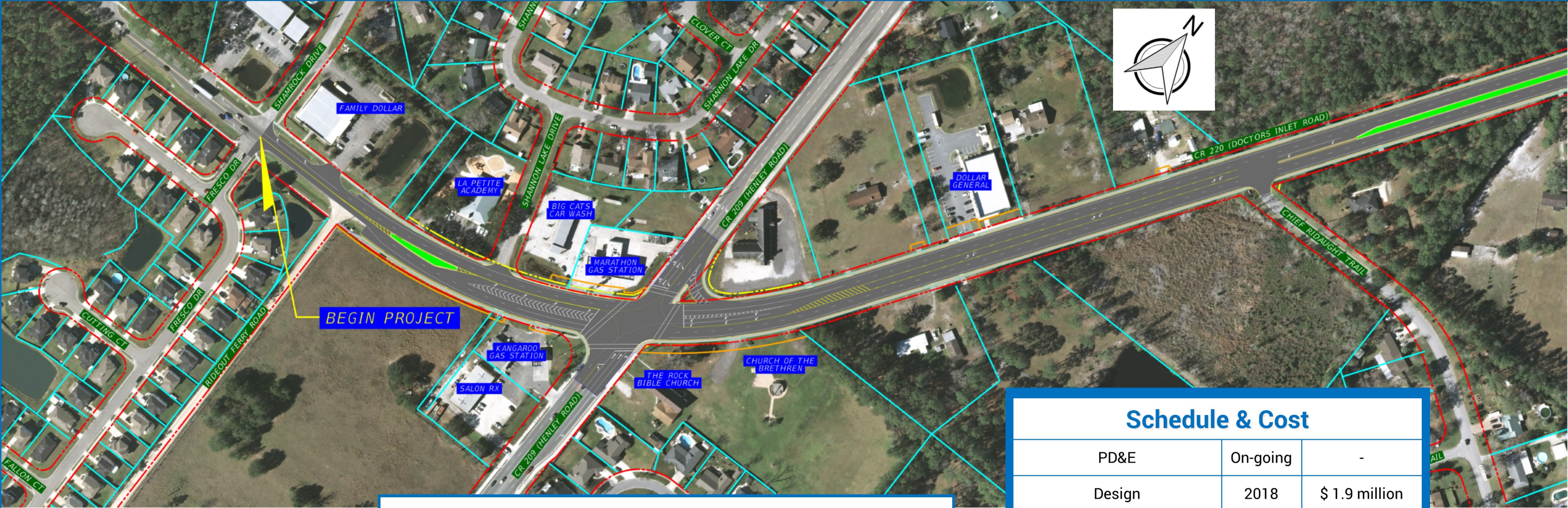
CR 220 Proposed Improvements