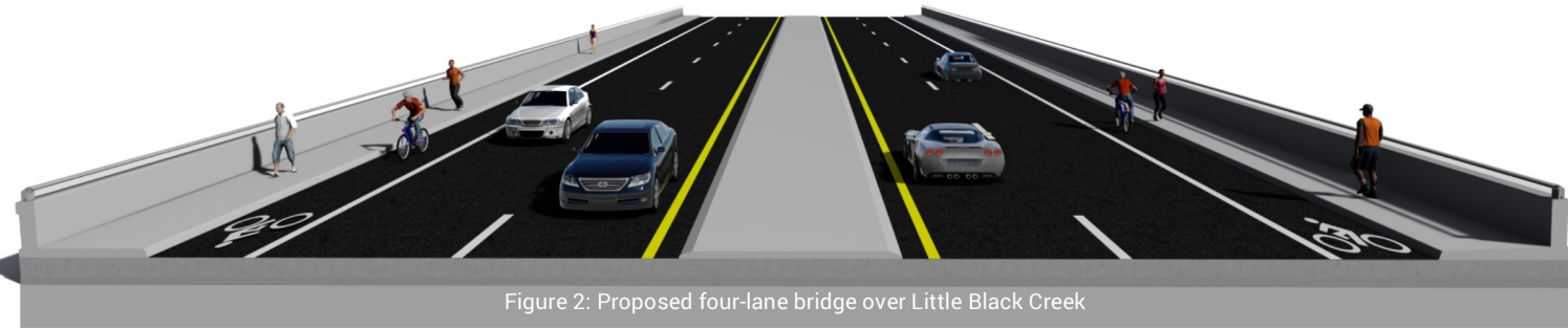
Figure 2: Proposed four-lane bridge over Little Black Creek

The proposed project would also widen the CR 220 bridge over Little Black Creek (Refer to Figure 2). Sidewalks and bicycle lanes would also be provided on the bridge.