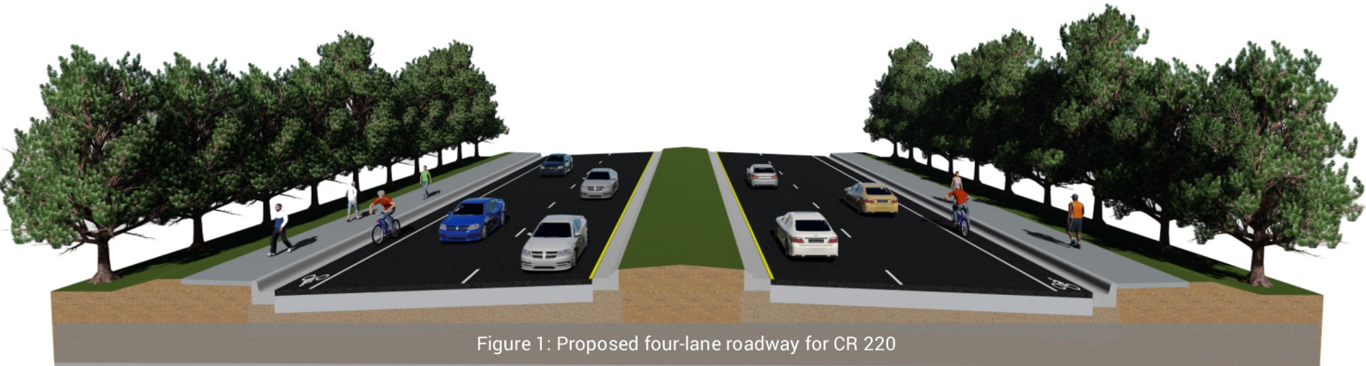
Figure 1: Proposed four-lane roadway for CR 220

The proposed project would widen CR 220 to a four-lane divided roadway (Refer to Figure 1). The proposed improvements would also add sidewalks and bicycle lanes to CR 220.